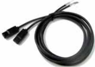
2745 Tab Adaptor Harness. Handy when replacing defrosters with the Clear View defrosters.

This handy wire harness extends power and ground wires to match up with the Clear View defroster tabs. The kit's two wire adaptors include spade terminals which plug into the vehicles defroster connectors and the tabs on the Clear View.