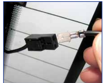
Tab Adaptor connects to vehicle plug...