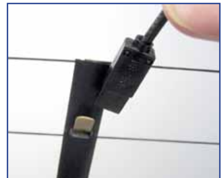
...then to Clear View defroster tab