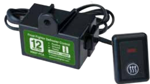
ThermaSync Timing Defroster Control and Switch

© 2012 Planned Products LLC All rights Reserved Frost Fighter and ThermaSync are Registered Trademarks of Planned Products LLC