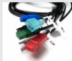
Color coded connectors

The defroster switch features an easy push button, standard defroster symbol and red indicator light. The ThermaSync control connects to the switch with 34 inch (91) flat cable. The switch can be positioned in the dash while the control can be tucked neatly away under dash.