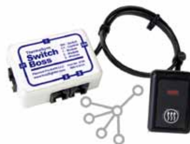
Many defrosters, one switch SwitchBoss Network control