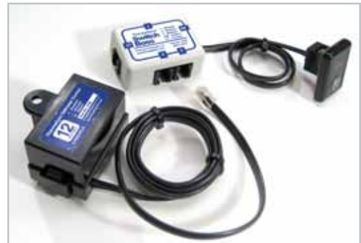
Connect the CT Control Master