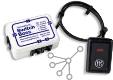
Switch Boss Network Control

© 2012 Planned Products LLC All rights Reserved Frost Fighter and ThermaSync are Registered Trademarks of Planned Products LLC