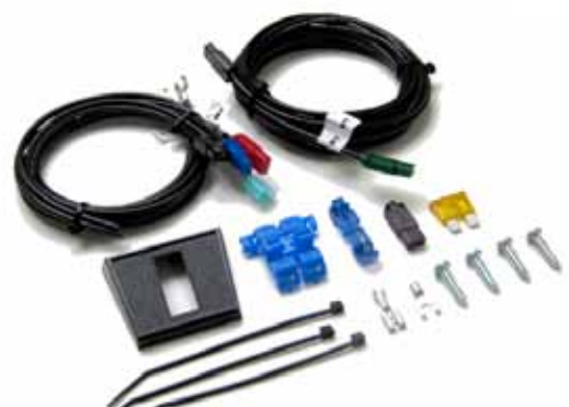
ThermaSync Installation Pack