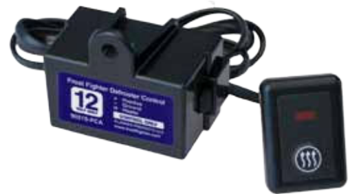
ThermaSync Timing Defroster Control and Switch