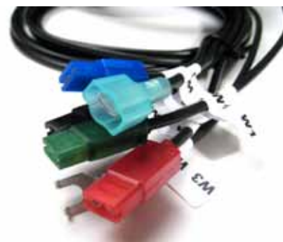
Installation pack connectors