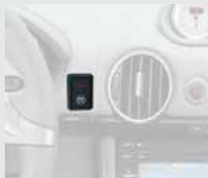
In dash defroster switch mount

Both ThermaSync defroster controls and Clear View II defrosters are available in 12 and 24 volt.